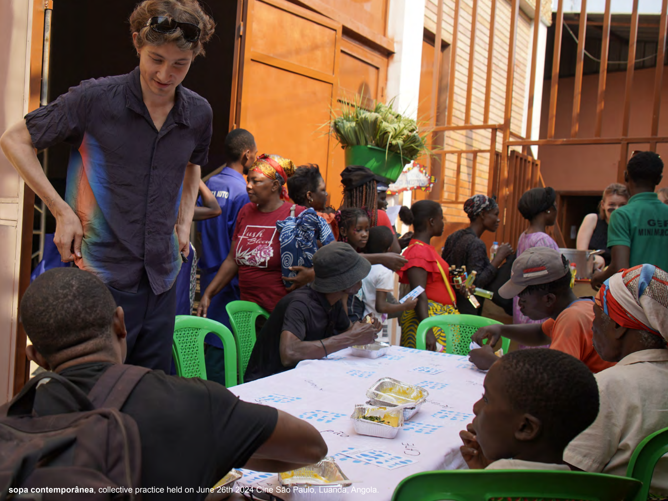
sopa contemporânea, collective practice held on June 26th 2024 Cine São Paulo, Luanda, Angola.