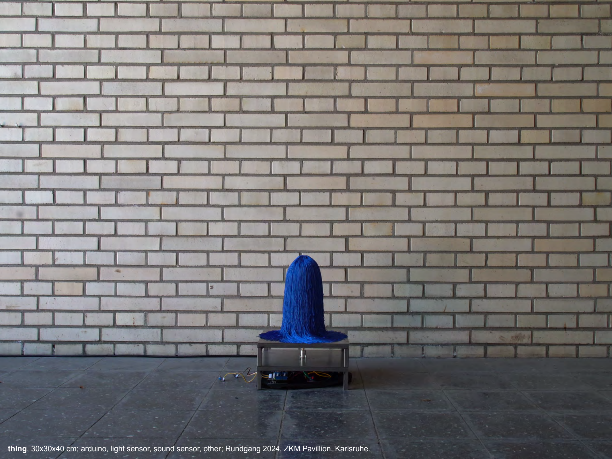
thing, 30x30x40 cm; arduino, light sensor, sound sensor, other; Rundgang 2024, ZKM Pavillion, Karlsruhe.