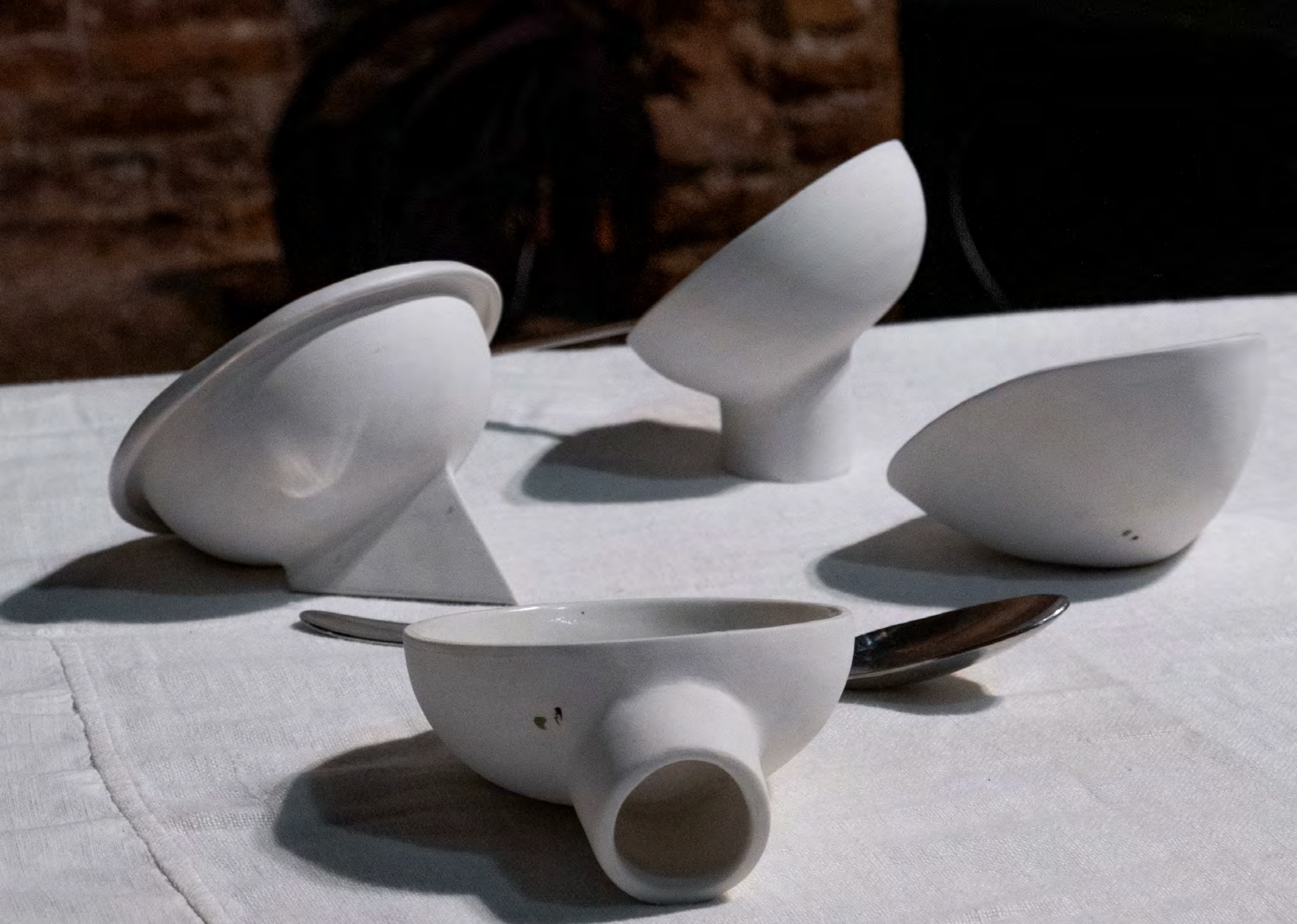
brodo contemporaneo, collective practice held on October 6th 2024, S.a.L.E. Docks, Venezia.