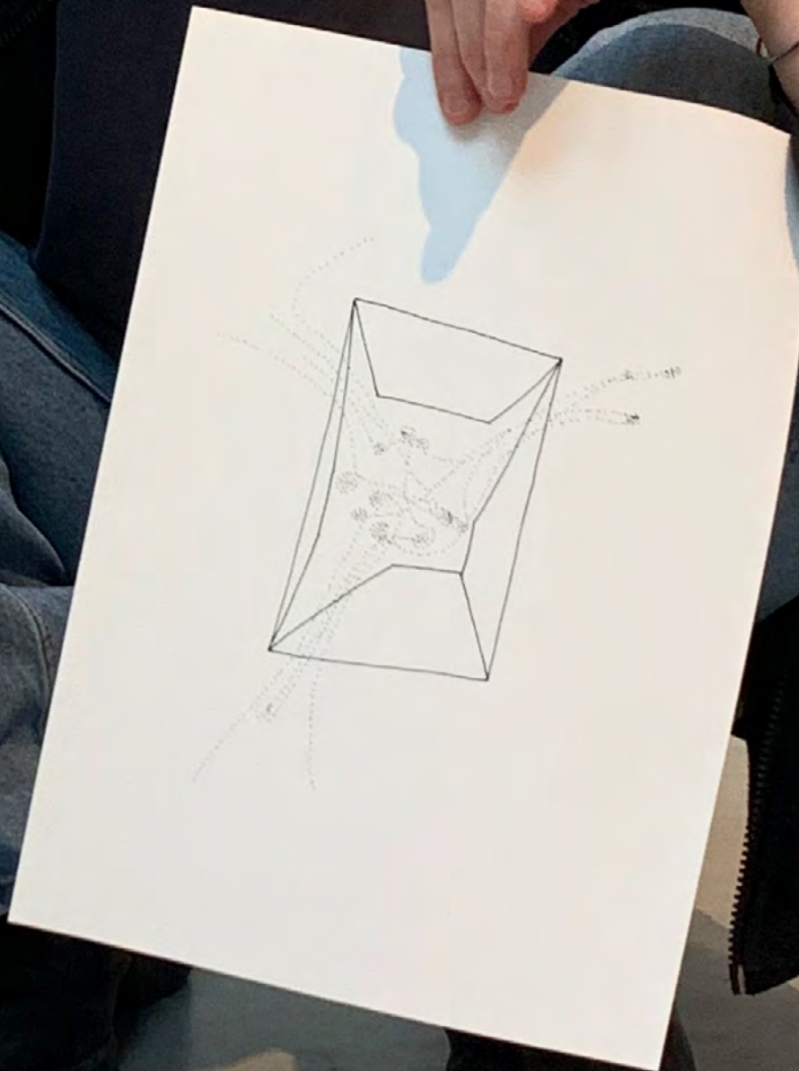
di imbarazzo e attriti, collective performance with sand; workshop with Helène Delprat: "Me without me" 2022, Teatrino di Palazzo Grassi, Venezia.