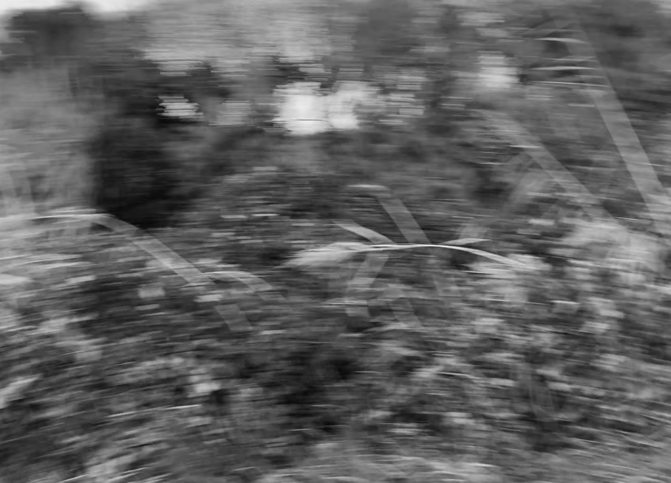
è tutto oro ciò che luccica, audiovisual installation; laptop, kinect 360, video: durata minima 97' 21", 1080x720 px, 30 fps;tw The Imaginary Museum 2023, Ca' Tron, Venezia.