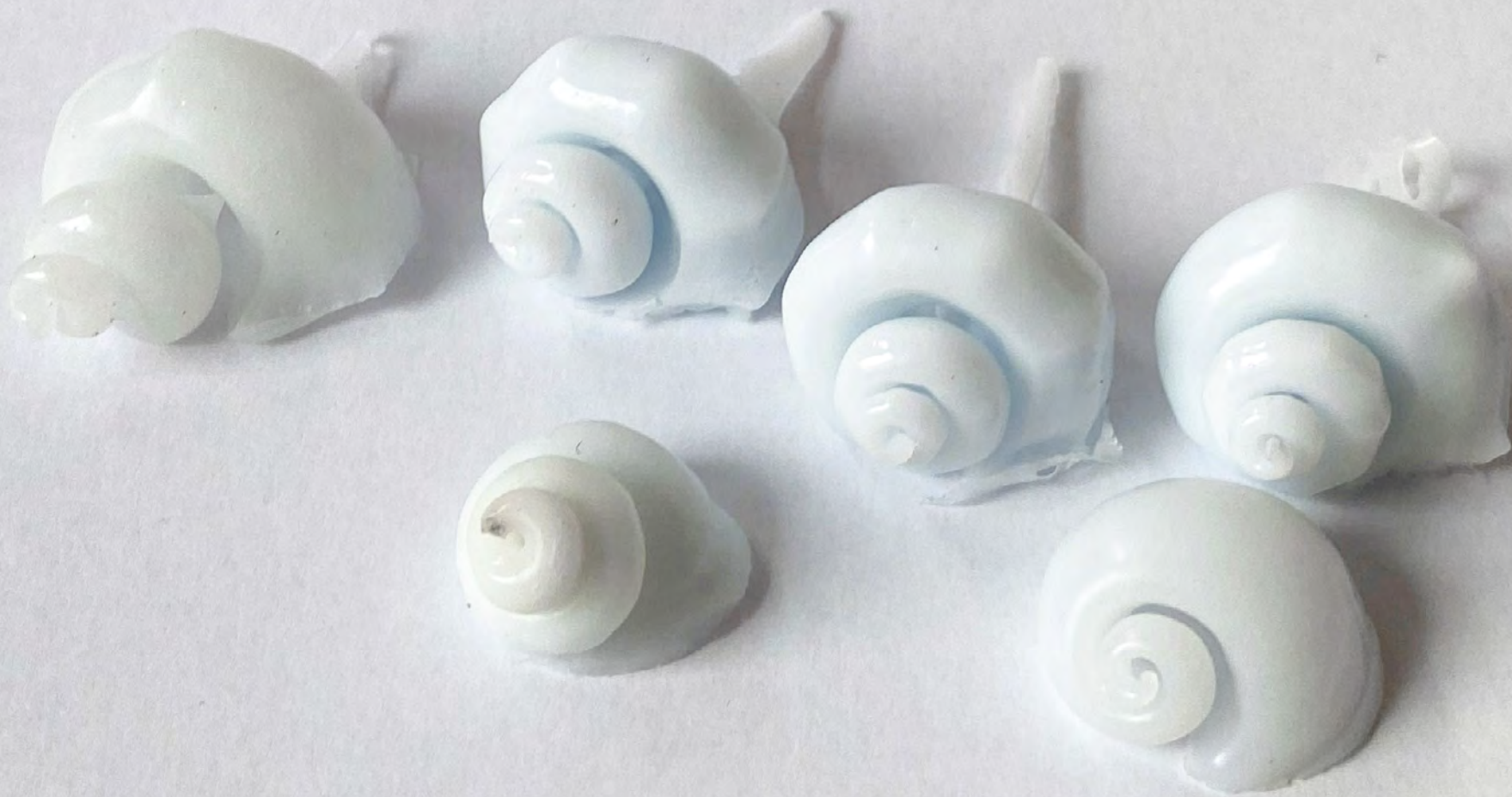
untitled (shell), sculptures 3 x 3 x 5 cm; silicone rubber; 2024.