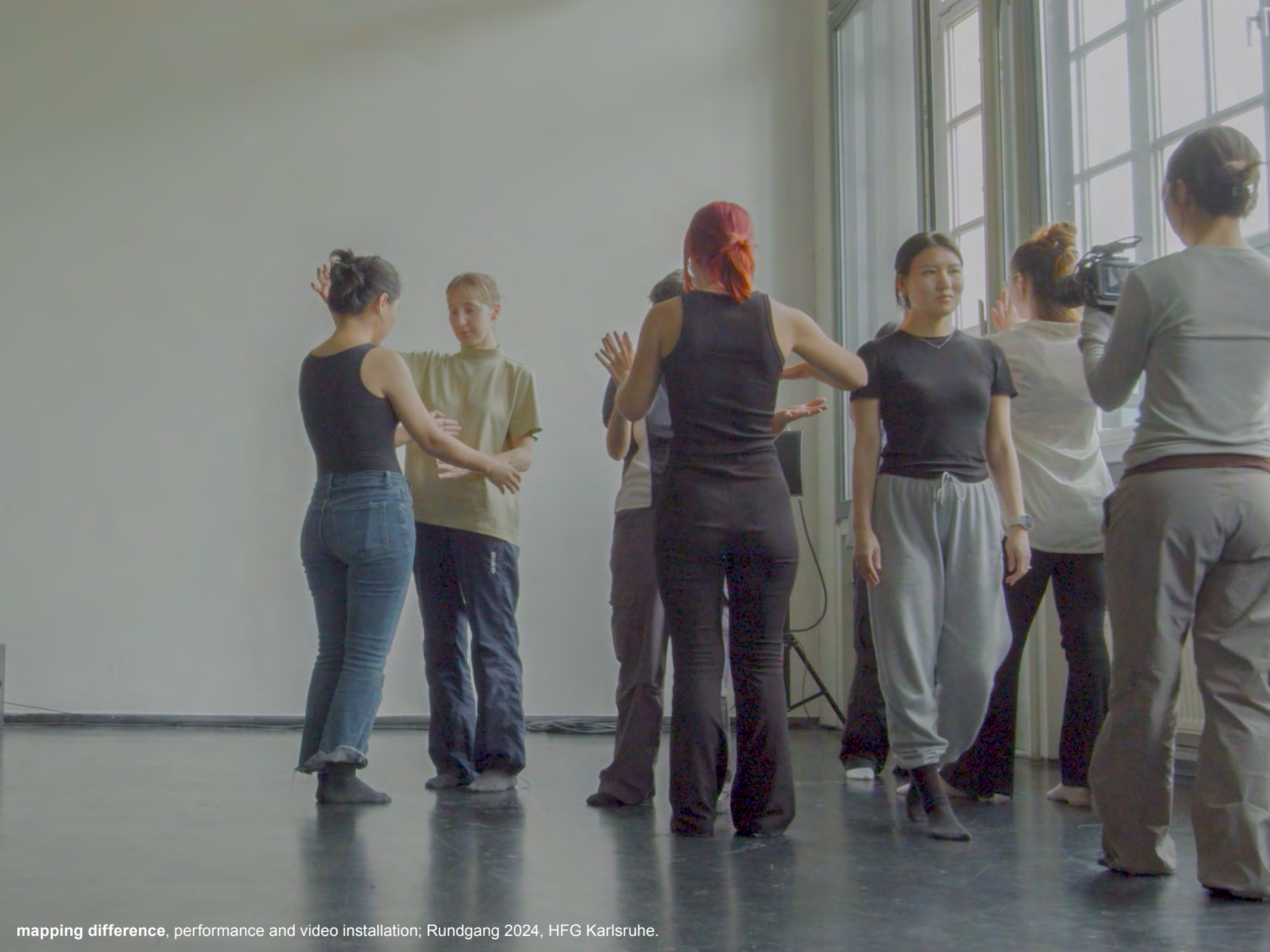
mapping difference, performance and video installation; Rundgang 2024, HFG Karlsruhe.